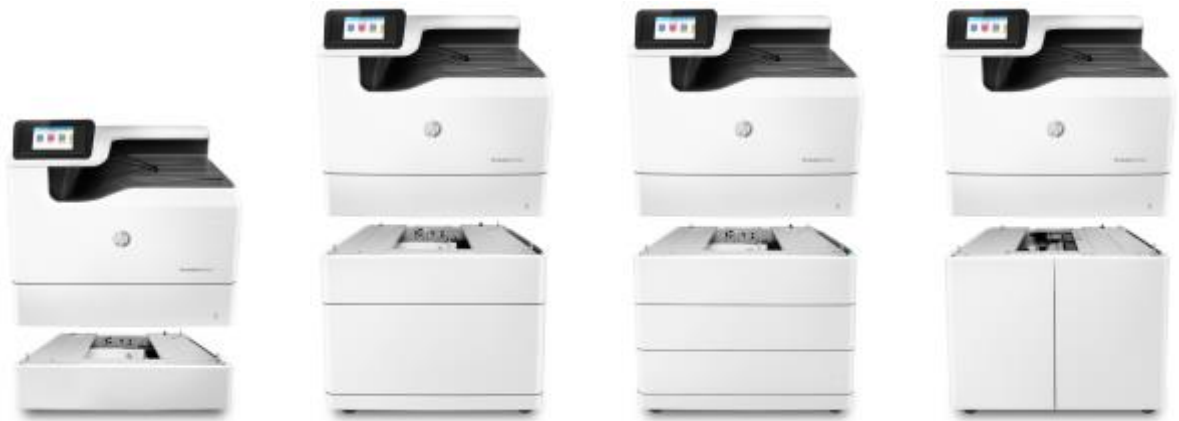
550-sheet paper tray (A7W99A)