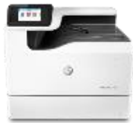
HP PageWide Pro 750dw